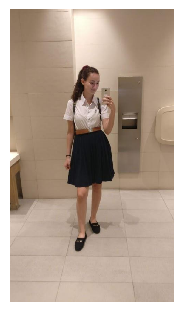
The Chula school uniform.