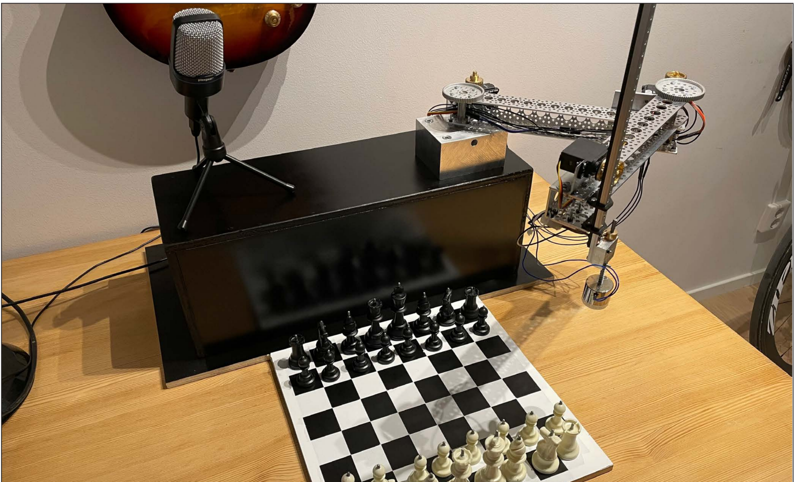
Final prototype of PiChess.