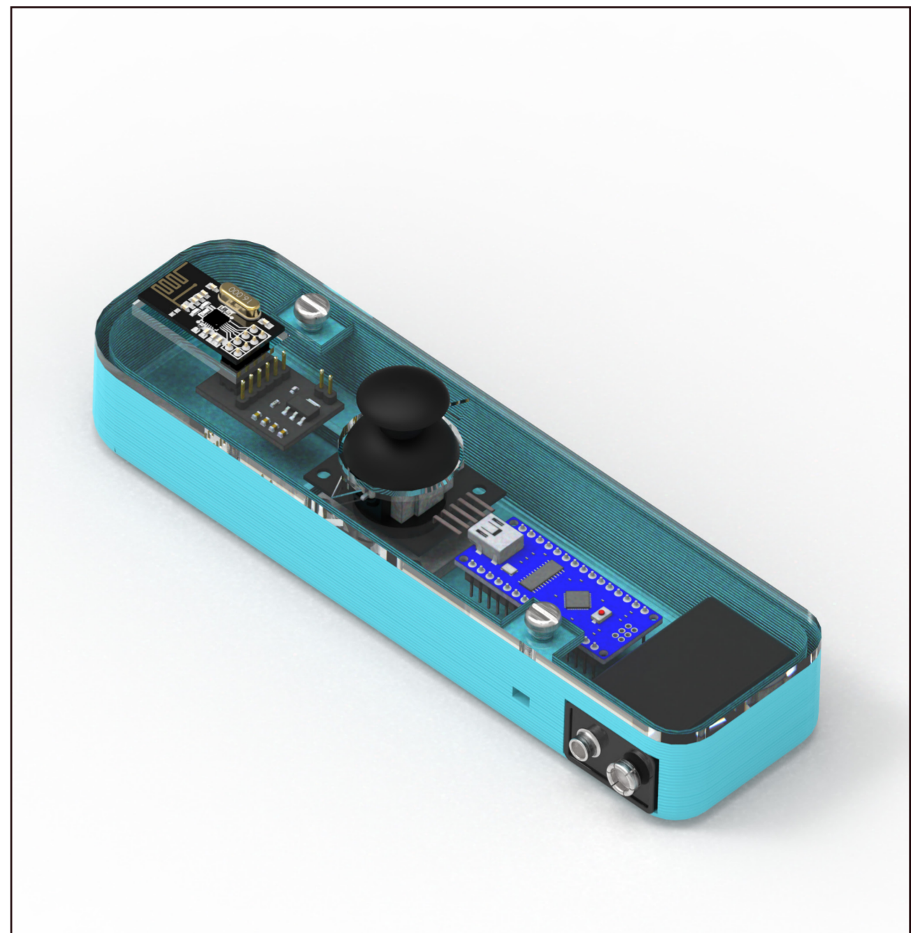
A remote control which steers the bowling ball to the desired direction in real time.