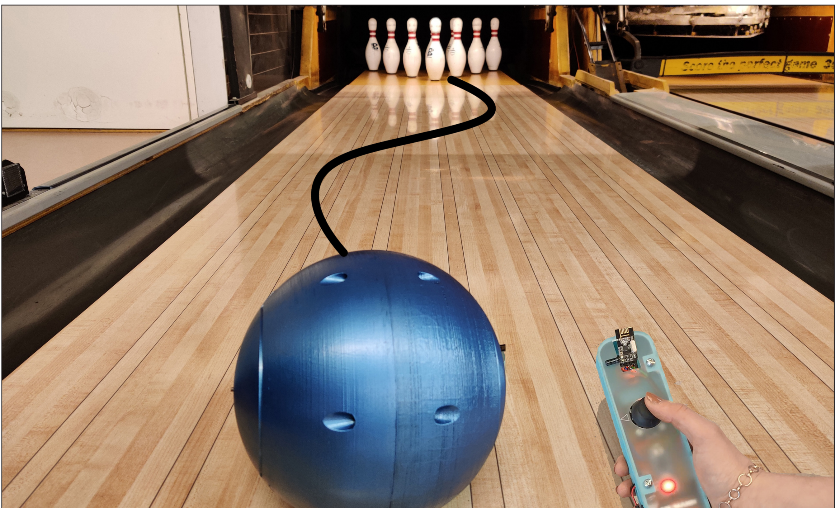
The remote sends directives to the servo motor which turns the pendulum weight to the left and right. This drastically changes the center of mass and steers the bowling ball.