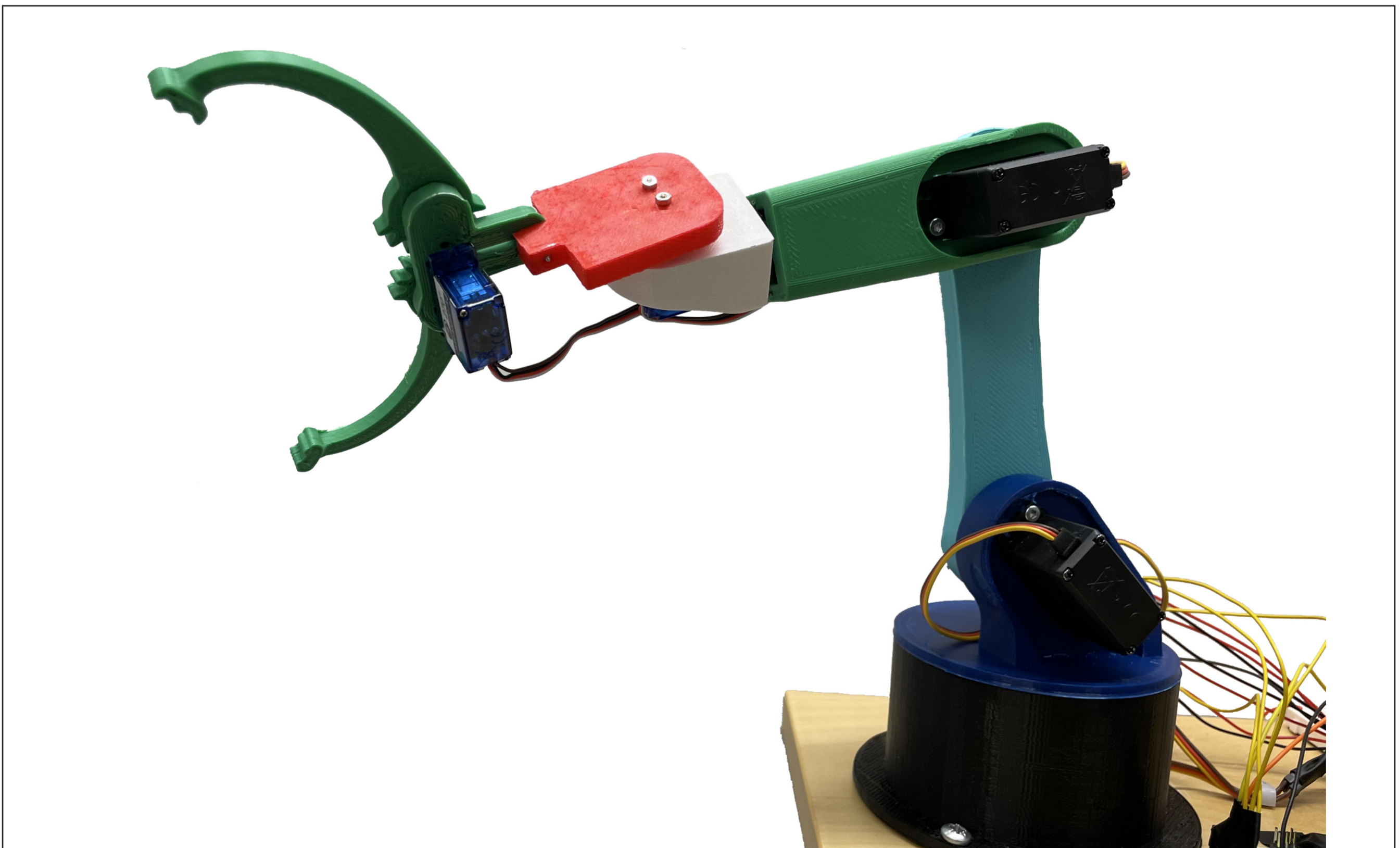
The final prototype constructed