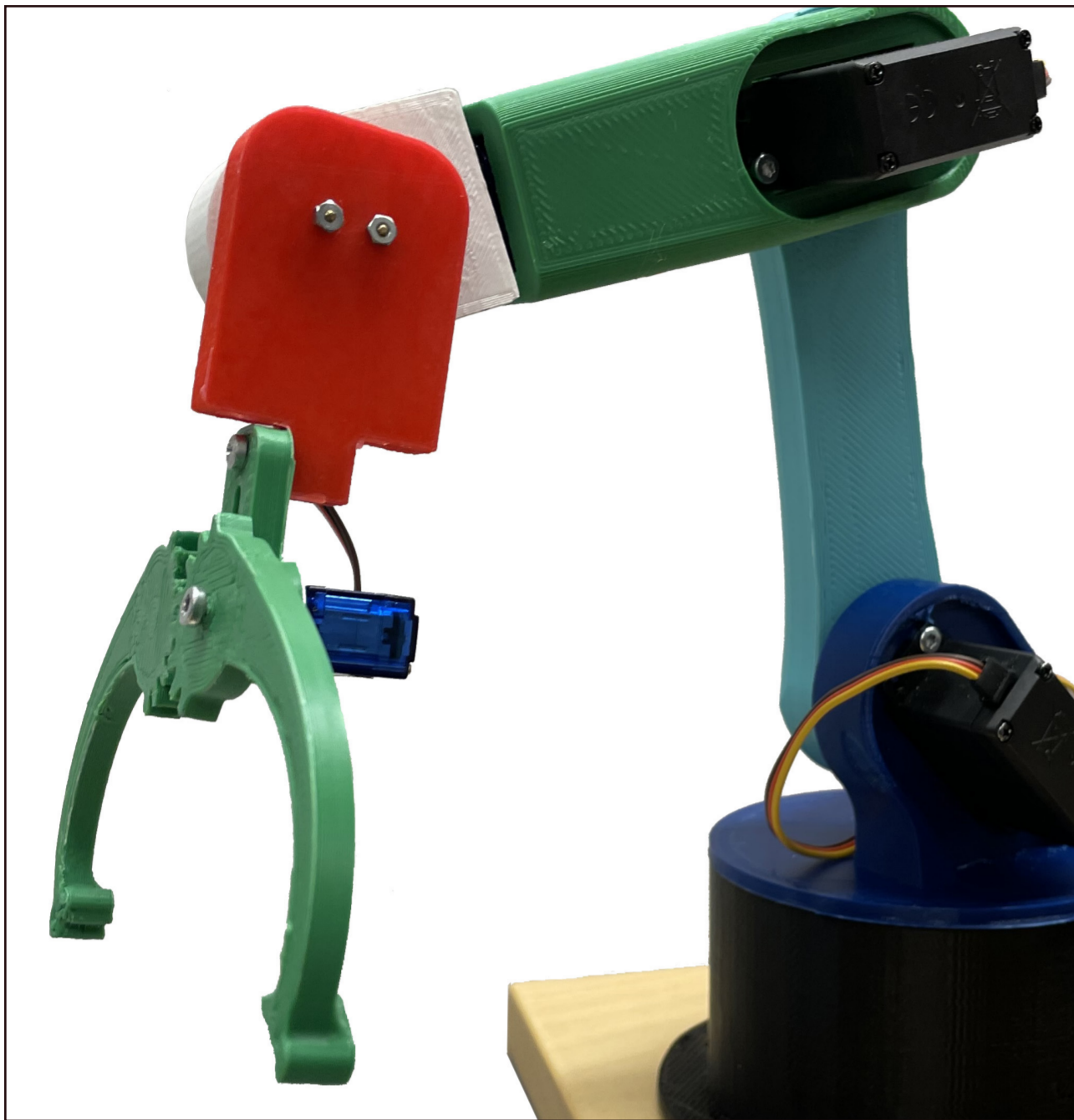
Sideview of the robot arm