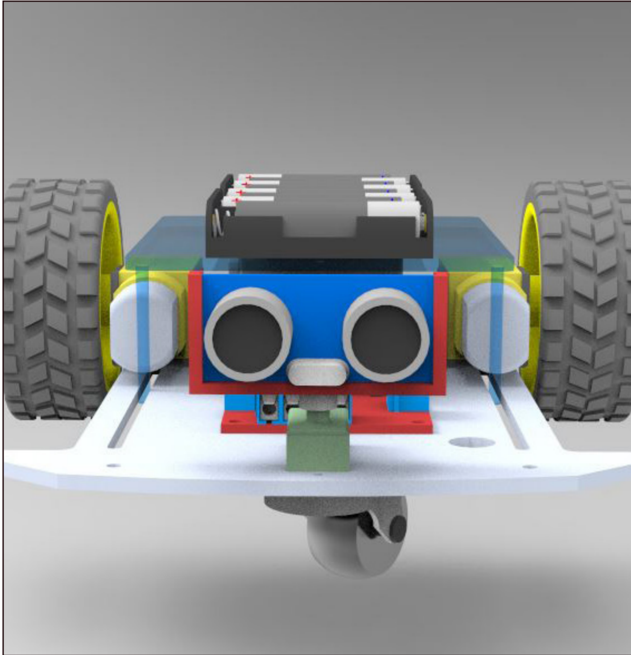
The ultra sonic distance sensor protects the robot from driving into obstacles.