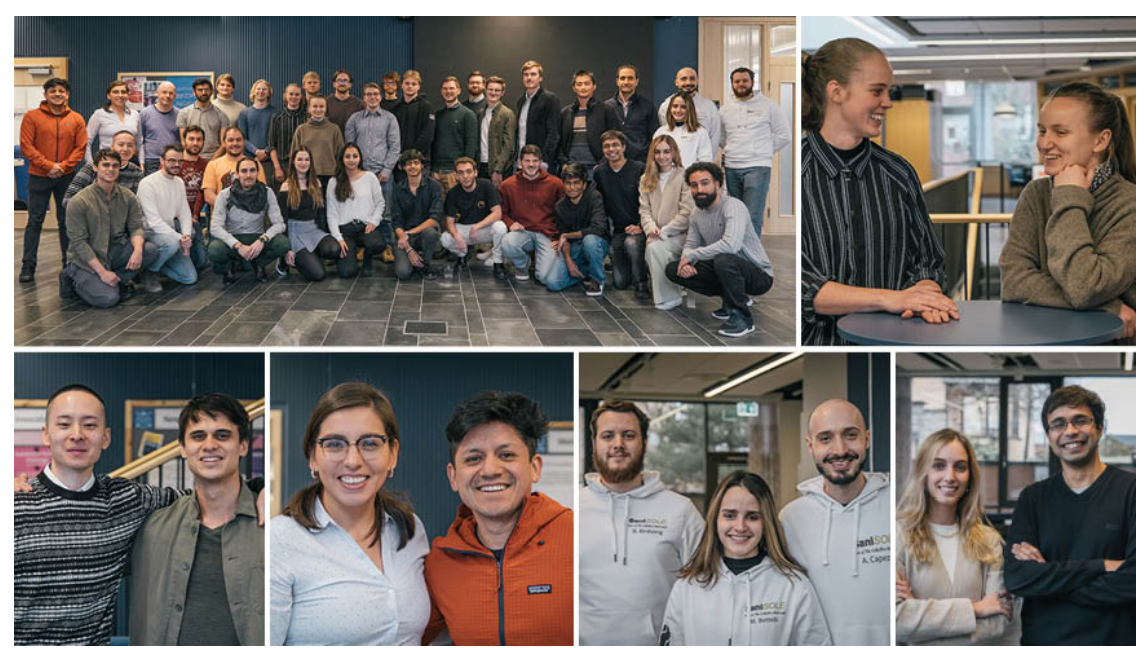
The teams in Batch 15 of the KTH Innovation pre-incubator program met for the first time at Teknikringen 1.