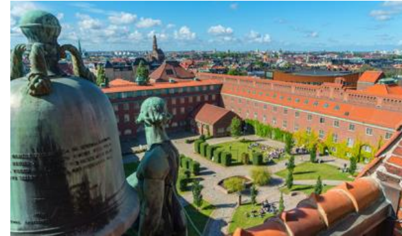
The plan for the merger