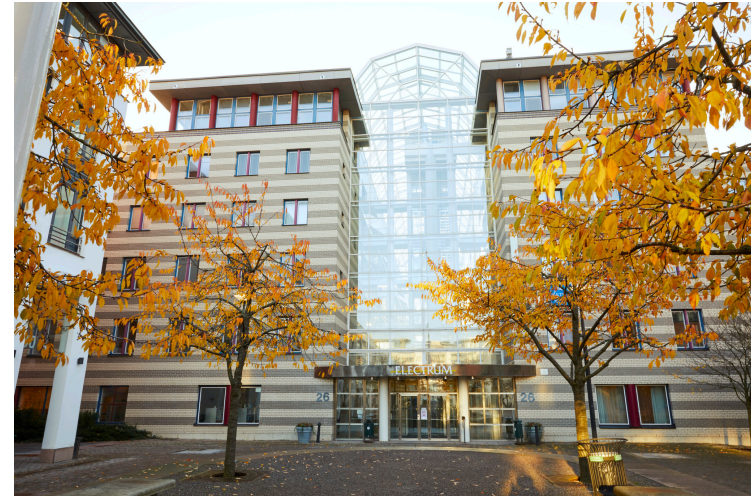
Kista is under development