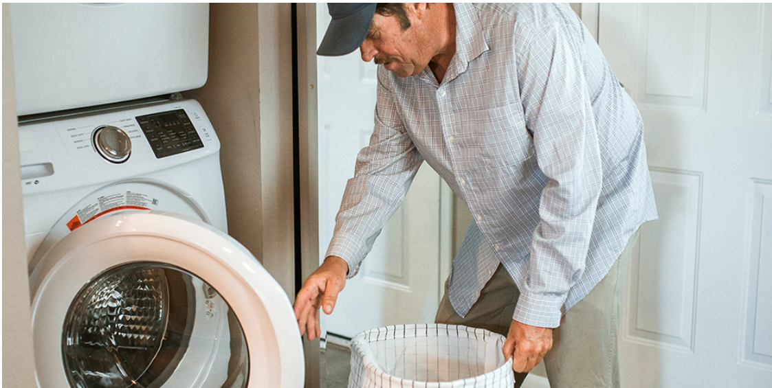
In the future you might rent your washing machine and pay per wash.