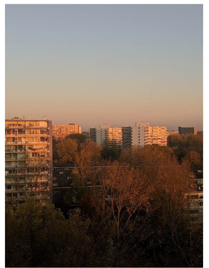
View from accommodation in Delft